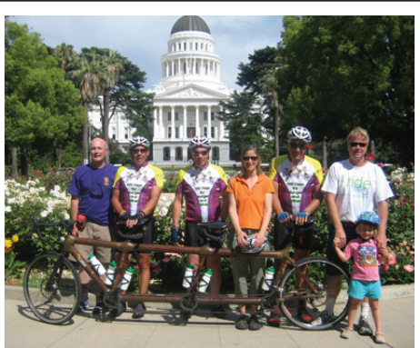
Raising funds for ELCA World Hunger, Tour de Revs visits Capitol Park (hosted by LOPP).

T HE LUTHERAN OFFICE OF PUBLIC POLICY – CALIFORNIA is a vehicle for public policy education and advocacy on matters of hunger and economic justice, the health and integrity of God’s creation, and human rights and human dignity. It serves the California expressions of the ELCA as they seek to express God’s love and care for our neighbors – especially the “least of these” – who experience poverty, deprivation, and discrimination.